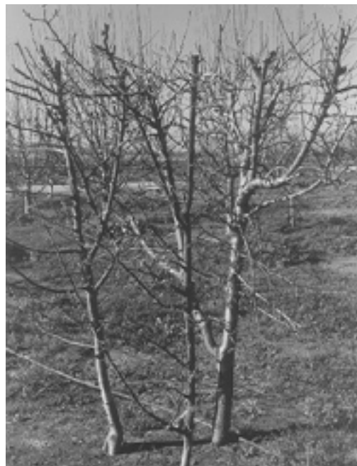
An example of 3 trees in one hole

See our FREE Backyard Orchard Culture Guide for planting and pruning tips for high density planting to maximizing harvests in your garden space.